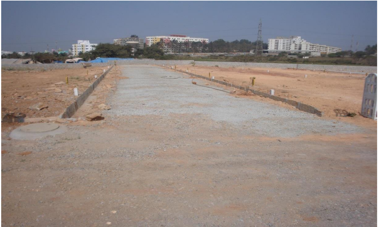
Layout View 4 (Western View of Layout)